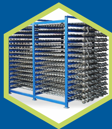
Production upto 10 m 3 /hr