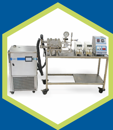
Lab Flow Systems