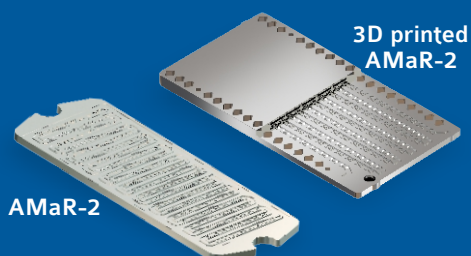
3D printed AMaR-2

Well researched reactor designs to suit your specific applications from 1ml to 200 ltr reactor volume